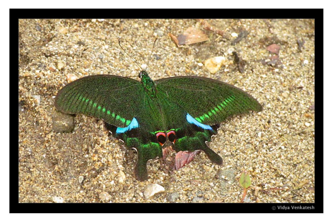
Image of a Paris Peacock, which is similar to the Indonesian Green Swallowtail

Stunned by the iridescence of the blue-green wings of the Green Swallowtail butterfly, researchers studied the structure of the wing and found that the colours resulted from cleverly manipulated light rays. The butterfly's wings consist of tiny scales made of alternating layers of chitin and air. Interplay of light and colours is achieved by the absorption and refraction of different wavelengths of light by these layers thus creating varied hues, without pigments/dyes.