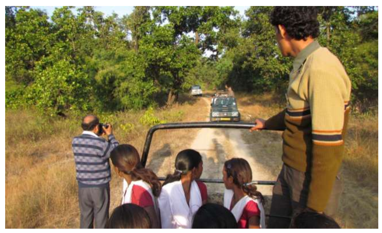
Image 9: Field Director of Bandhavgarh Tiger Reserve interacting with and motivating the village kids.