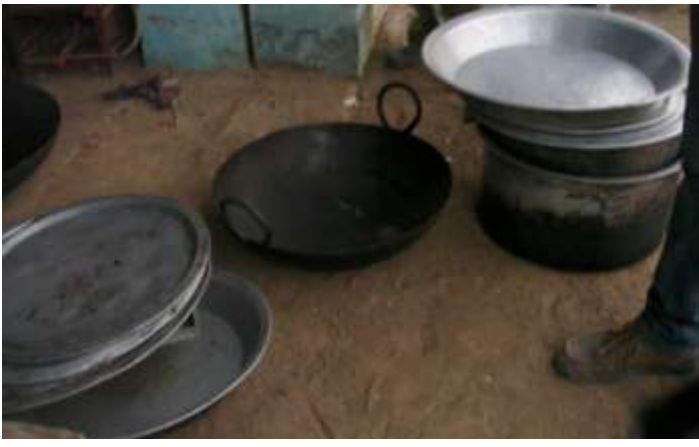
Image 1 & 2: Transportation of vegetables and utensils from Umaria to Marai Khurd.