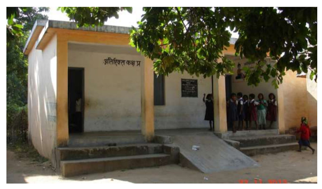
Image 3: School building at Marai Khurd where we learnt, debated and even dined!