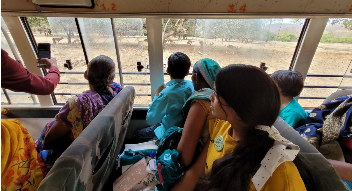
Figure 6 Villagers enjoying sighting of wild herbivores in Panna TR.

After the event, a canvas water bottle was given to attendees and a safari ride was also arranged for the park and to a local waterfall, the Pandav Falls. Overall, the three month long program was also used as an opportunity to build a relationship and trust amongst the different stakeholders, especially the forest department, of which several guards, officers, and rangers also attended, with the local community.