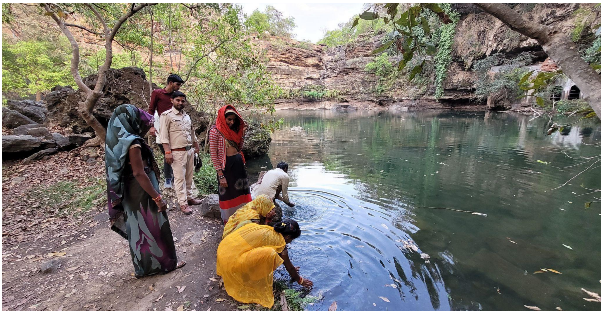
Figure 7 Villagers and the forest guard chatting and enjoying the cool waters of the Pandav Kund.

After the event, a canvas water bottle was given to attendees and a safari ride was also arranged for the park and to a local waterfall, the Pandav Falls. Overall, the three month long program was also used as an opportunity to build a relationship and trust amongst the different stakeholders, especially the forest department, of which several guards, officers, and rangers also attended, with the local community.