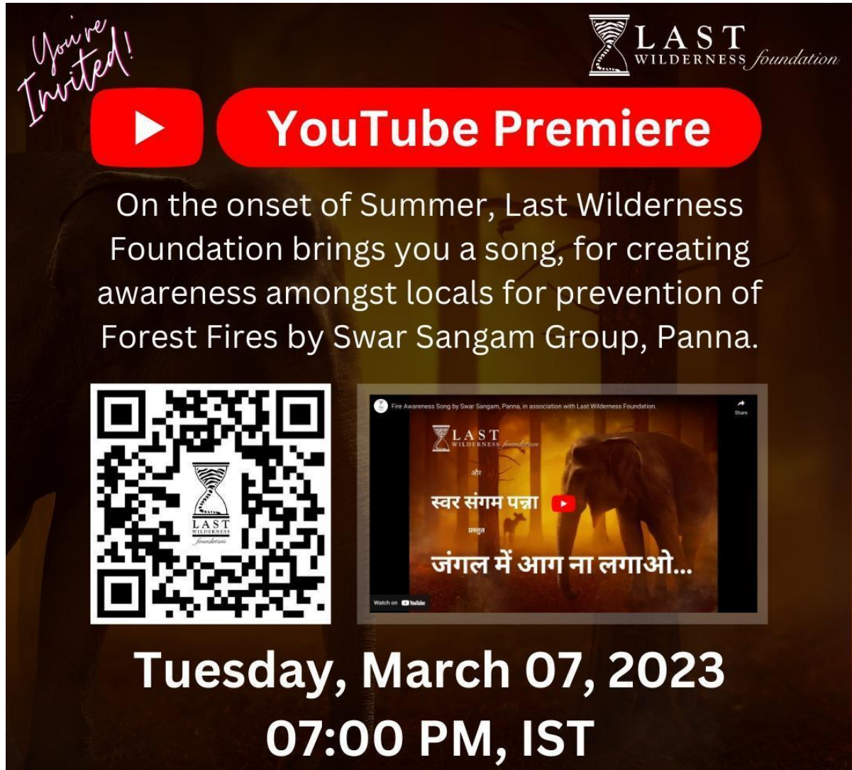
Figure 8 Screen shot of YouTube premiere of Fire Safety and Awareness song

Additionally, a Fire Awareness Song was specifically produced, with the help of the local Bundelkhandi music group - Swar Sangam Panna - and was premiered on You-Tube LWF channel and also shared wildly as a whatsapp forward in the community.