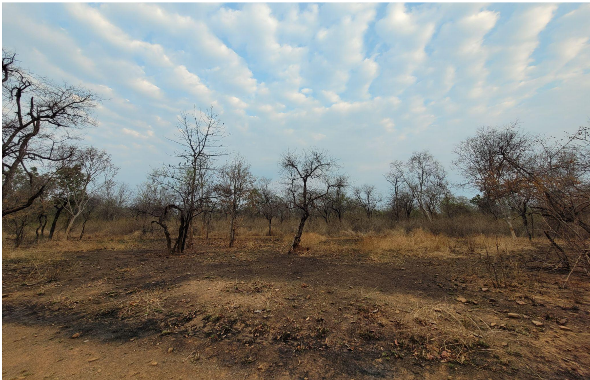
Figure 2 The deciduous forest of the Panna landscape is prone to forest fires.

In the peak summer months, Panna Tiger Reserve is particularly prone to forest fires due to the extremely dry landscape. Furthermore, small fires by local villagers for cooking in the fields are often a high risk factor for the start of forest fires that can quickly spread across vast expanses of the forest and cause unparalleled loss of life and resources. Although the forest department has set protocols in place for fire prevention and safety procedures in the event of a forest fire, it is often an uphill struggle given the unsafe practices followed by local communities that could lead to accidental forest fires, and the vast range that is difficult to be covered by limited forest staff.