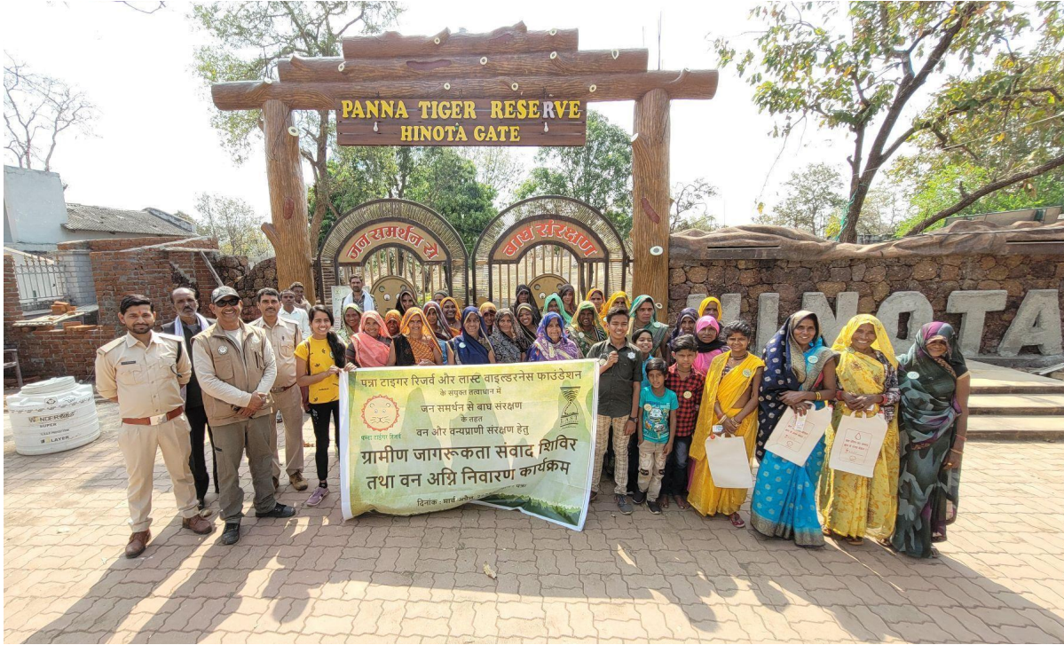
Figure 1 The villagers post for a group photo during the Fire Awareness Outreach program, before going for a Safari in the Panna Tiger Reserve.