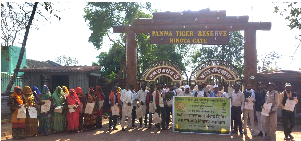
Figure 4 Group snap of the villages at Hinota gate proudly displaying the canvas water bags distributed at the Fire Awareness program at Hinota, Panna TR.