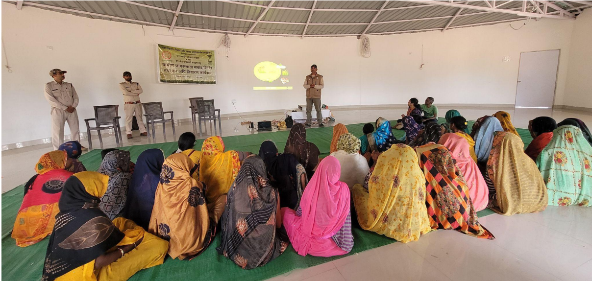
Figure 3 Villagers attending the indoor session at the Interpretation Center near Hinota Gate

Therefore, a Fire Awareness and Prevention Program was developed to spread awareness on gaining knowledge and following safe practices to avoid the start and spread of forest fires. Further to this, the program was also developed as an aide to establish a dialogue and build a positive and trusting relationship between the different stakeholders residing and working within tiger reserves.