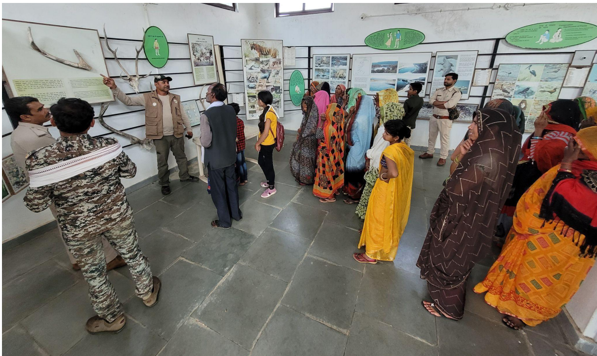
Figure 5 Visit to the Nature Interpretation Centre at Hinota to know more about the park.

The program was held at the Panna Interpretation Center, which provided an appropriate backdrop to introduce attendees to the history and biodiversity of the park, providing a context for the main program. In batches of 25, different factions of society, which included men, women, and youths, were engaged with via the aid of interactive sessions, presentations, environment-themed games and visit to the local Interpretation Center.