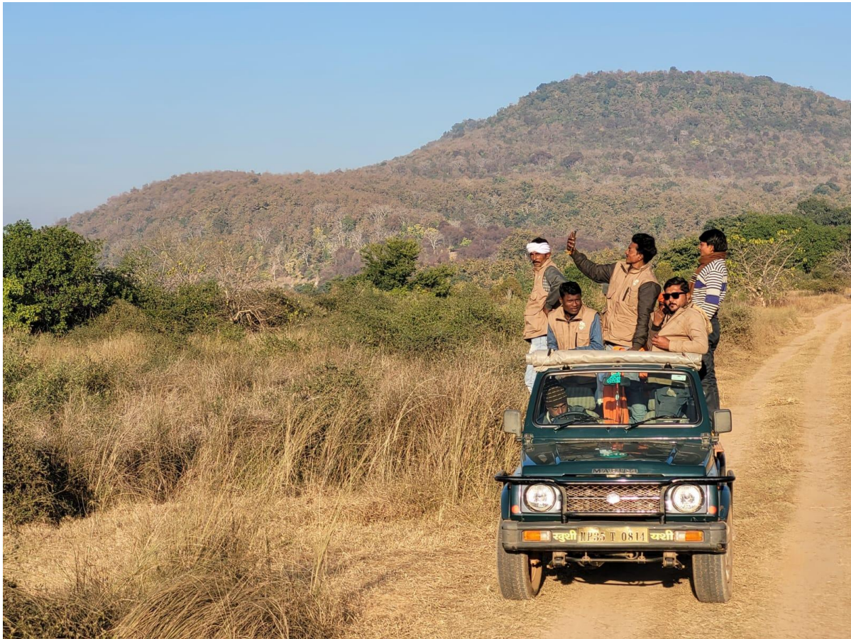
Figure 2 GRs on safari in the park as part of an incentivization effort in collaboration with the Forest Department

shared via the Whatsapp group, increasing the speed and efficiency of information gathering