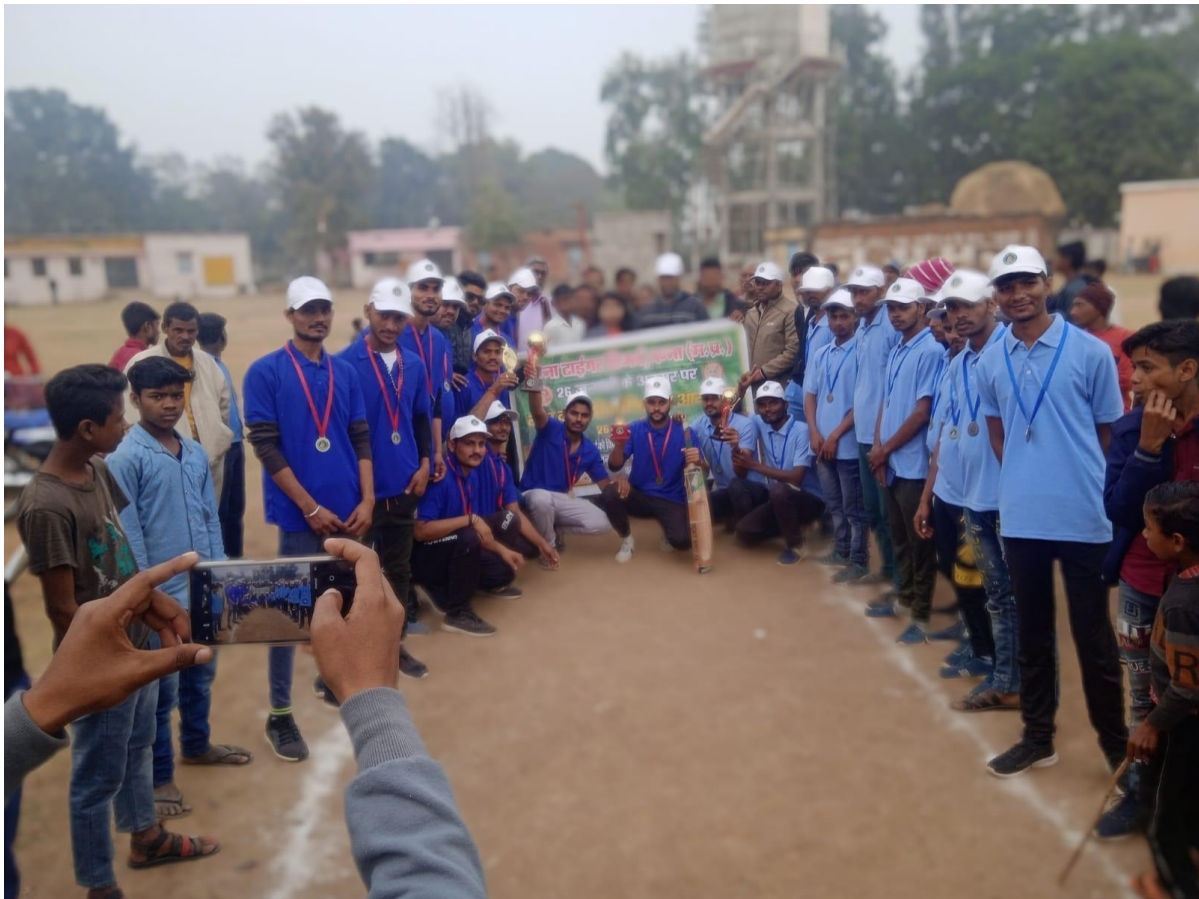
Figure 1 Friendly cricket match played among villagers as part of Republic Day celebrations