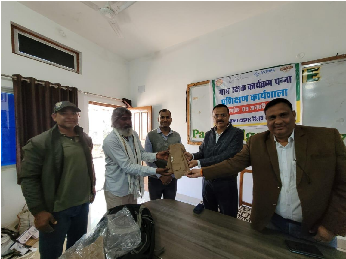
Figure 3 Field jackets distributed at the end of a motivational meeting with senior staffs of the Forest Department