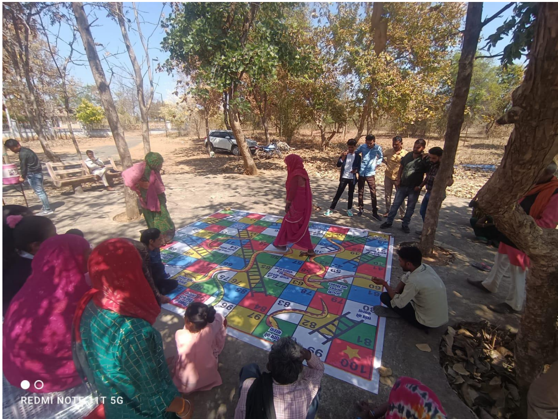
Figure 4 GRs engaging with villagers in environment-themed games during a Fire Safety and Awareness project being run in PTR to prevent forest fires